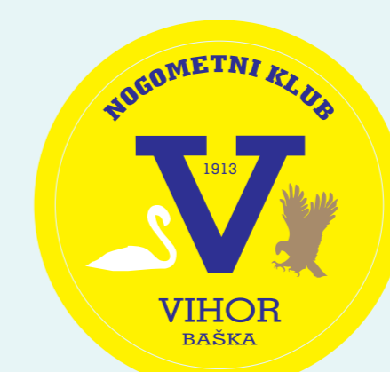
Photo exhibition on the 100 th anniversary of FC Vihor.

Organizator / organizer: NK „Vihor“ / FC Vihor